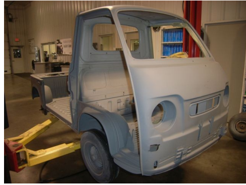
After soda blasting