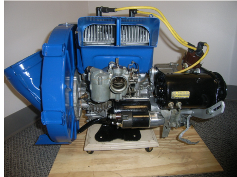
The rebuilt drive-train