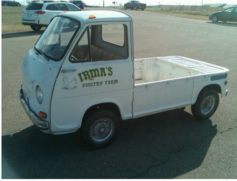
Irma after arrival