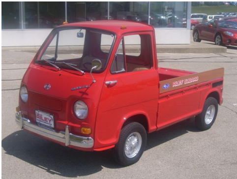
Truck after restoration