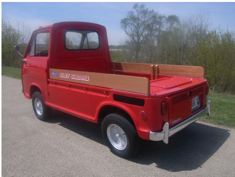
The rear of the truck